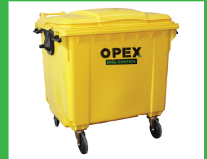
Oil & Fuel Spill Kit 1200 Liter