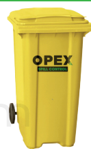
Acid Spill Kit 120 Liter