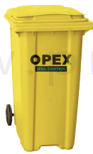
Universal Spill Kit 120 Liter