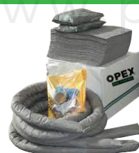
Universal Spill Kit 360 Liter Refill