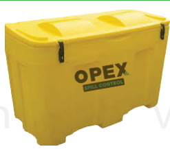
Chemical Spill Kit 660 Liter