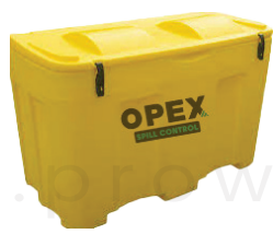
Universal Spill Kit 660 Liter