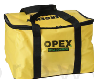
Bio hazard Spill Kit 20 Liter