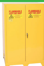
Safety Cabinet 90 Gallon