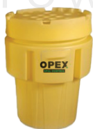
Universal Spill Kit 95 Gallon Over Pack