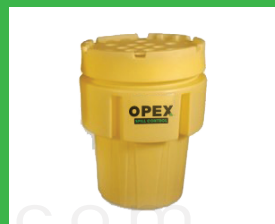
Oil & Fuel Spill Kit 55 Gallon Over Pack