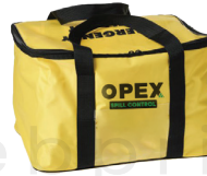
Universal Spill Kit 35 Liter