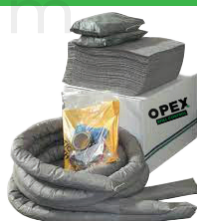
Universal Spill Kit 240 Liter Refill