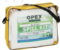
Oil & Fuel Spill Kit 50 Liter