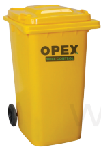
Universal Spill Kit 360 Liter