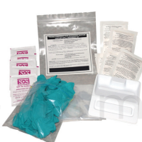
Bio hazard Spill Kit Emergency