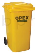
Universal Spill Kit 240 Liter