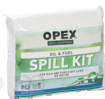
Chemical Spill Kit 25 Liter