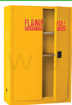
Safety Cabinet 45 Gallon