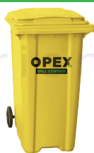
Chemical Spill Kit 80 Liter