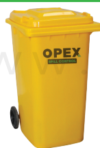
Chemical Spill Kit 240 Liter