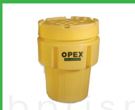
Oil & Fuel Spill Kit 30 Gallon Over Pack