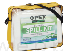
Chemical Spill Kit 50 Liter