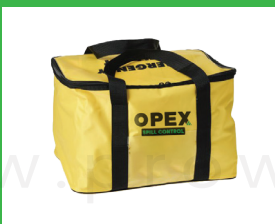
Oil & Fuel Spill Kit 25 Liter