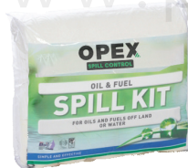
Oil & Fuel Spill Kit 25 Liter