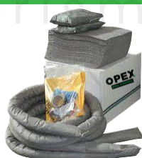
Universal Spill Kit 80 Liter Refill