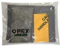
Universal Spill Kit 10 Liter