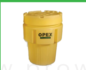
Oil & Fuel Spill Kit 25 Gallon Over Pack