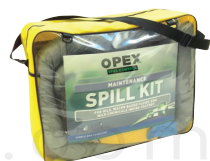
Universal Spill Kit 50 Liter