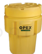
Universal Spill Kit 65 Gallon Over Pack