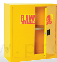
Safety Cabinet 30 Gallon