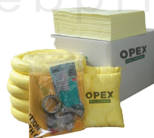
Chemical Spill Kit 240 Liter Refill