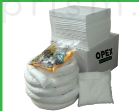
Oil & Fuel Spill Kit 240 Liter Refill