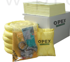
Chemical Spill Kit 120 Liter Refill