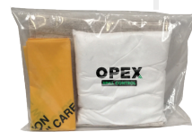
Oil & Fuel Spill Kit 10 Liter