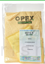
Chemical Spill Kit 10 Liter