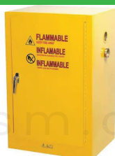
Safety Cabinet 12 Gallon