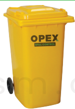
Chemical Spill Kit 360 Liter