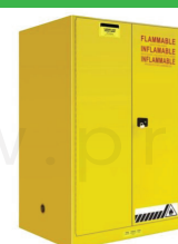
Safety Cabinet 110 Gallon