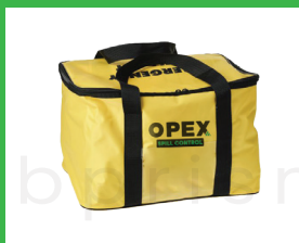
Oil & Fuel Spill Kit 35 Liter