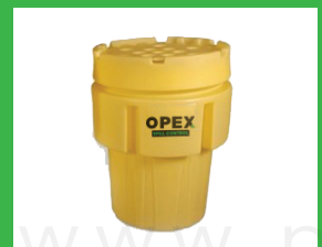
Oil & Fuel Spill Kit 65 Gallon Over Pack