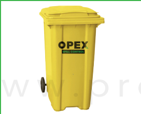
Oil & Fuel Spill Kit 120 Liter