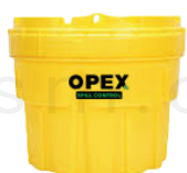
Chemical Spill Kit 20 Gallon Over Pack