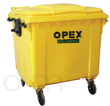
Universal Spill Kit 1200 Liter