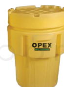
Chemical Spill Kit 65 Gallon Over Pack