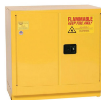
Safety Cabinet 22 Gallon