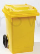
Acid Spill Kit 80 Liter