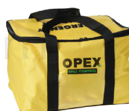
Acid Spill Kit 35 Liter