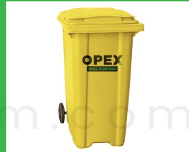
Oil & Fuel Spill Kit 360 Liter