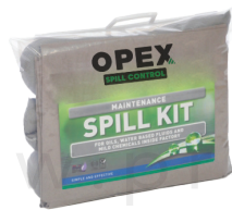
Universal Spill Kit 25 Liter