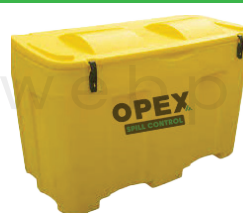
Chemical Spill Kit 350 Liter