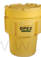
Acid Spill Kit 20 Gallon