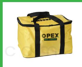
Oil & Fuel Spill Kit 10 Liter