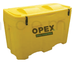
Universal Spill Kit 350 Liter