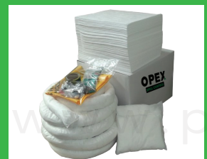
Oil & Fuel Spill Kit 120 Liter Refill