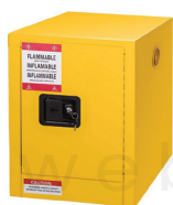
Safety Cabinet 4 Gallon