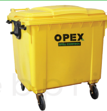
Chemical Spill Kit 1200 Liter