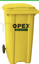
Chemical Spill Kit 120 Liter