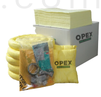
Chemical Spill Kit 360 Liter Refill