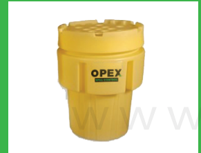
Oil & Fuel Spill Kit 20 Gallon Over Pack