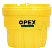
Universal Spill Kit 20 Gallon Over Pack